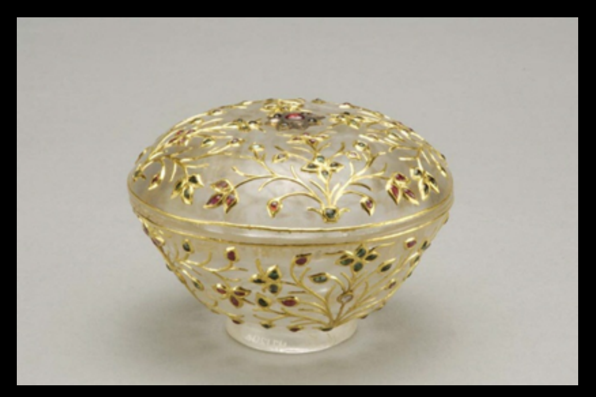
Right: Northern India Covered bowl, 19th century Rock crystal, gold, silver, and gemstones 2 ½ x 3 3/16 inches (5.7 x 8.1 cm)