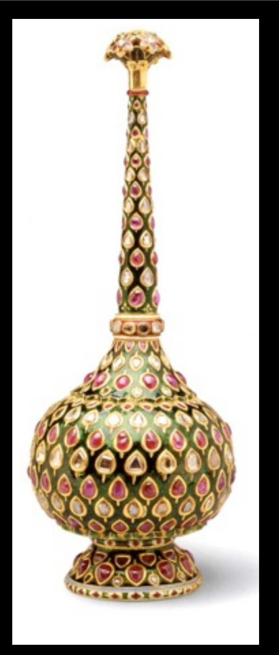
Left: Northern India Rosewater sprinkler, 18<sup>th</sup> century Enameled gold and gemstones 9 x 3 ¾ inches (24.1 x 9.5 cm)