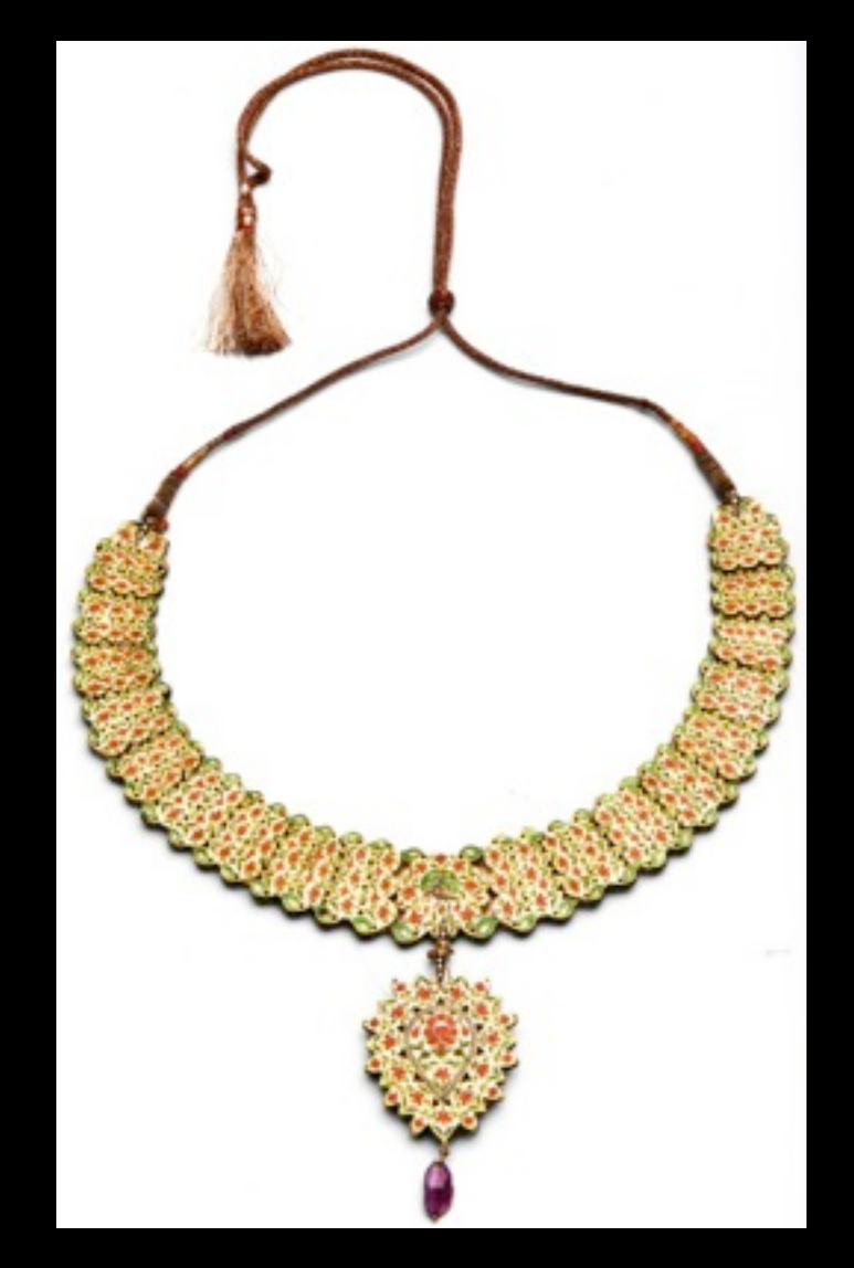
Left: India Necklace (view of front), late 19^{th} – early 20^{th} century Enameled gold with cabochon rubies, diamonds, and silk cord 6\ 5/16\ x\ 18\ 11/16 inches (16\ x\ 47.5\ cm)